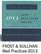
FROST & SULLIVAN Best Practices-2013