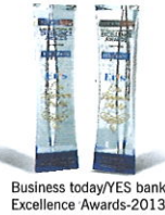
Business today/YES bank Excellence Awards-2013