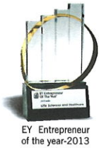
EY Entrepreneur of the year-2013