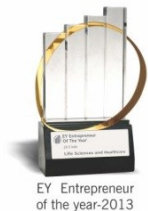
EY Entrepreneur of the year-2013