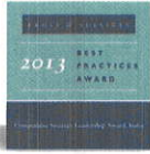
FROST & SULLIVAN Best Practices-2013