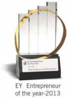
EY Entrepreneur of the year-2013