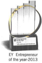
EY Entrepreneur of the year-2013