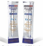
Business today/YES bank Excellence Awards-2013